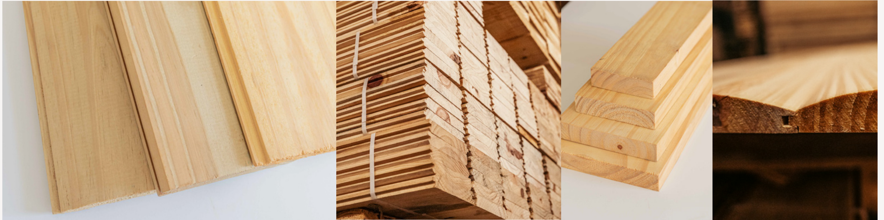
a) Tongue-and-groove boards: Traditional; English or “Cabañero” front.